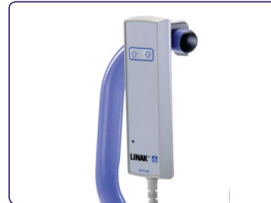
Hand control clip ensures convenient storage when not in use.