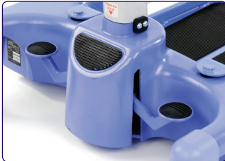
Foot 'push pad' helps reduce the force needed to initiate forward movement.