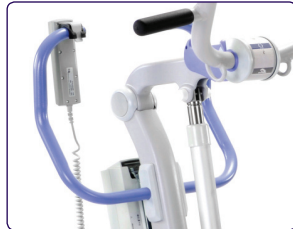
Over-sized push handle for improved handling and manoeuvrability.